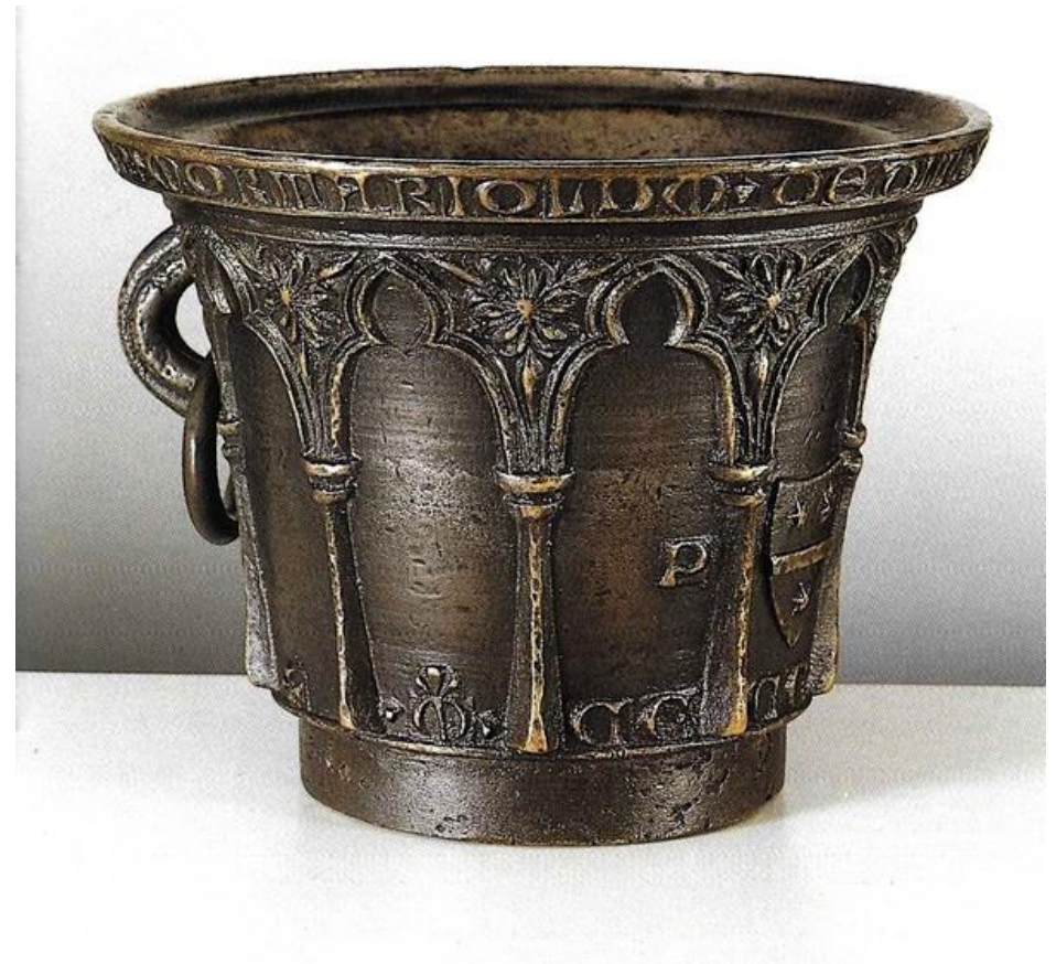
Mortier en bronze, Italie, 1483. Bronze mortar from Italy, 1483.