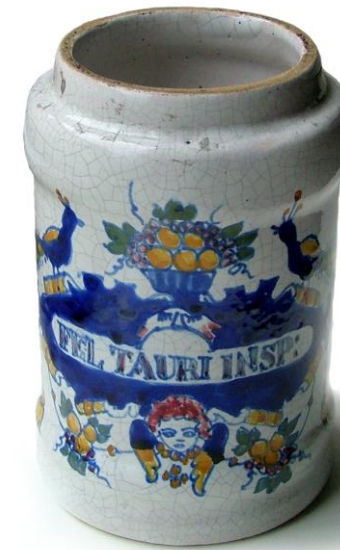
Pharmacy Jar from the 18th Century