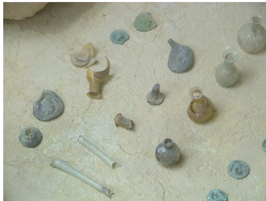
Anciens contenants pour huiles aromatiques. Musée Archéologique et Historique, Volterra, Italy.