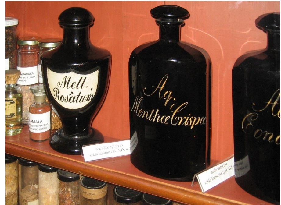
Hyalith glass bottles from the 19th century. Pharmacy Museum in Poznan, Poland. Author: Adrian Tync

Bouteilles en hyalith verre à partir du XIXe siècle. Musée de la pharmacie à Poznan, Poland. Auteur : Adrian Tync