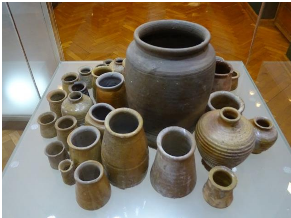
Stoneware containers for medicines from the turn of the 19th century. Archeological-Historical Museum in Stargard, Poland. Author: Jerzy Waliszewski

Contenants en grès pour médicaments à partir du tournant du 19ème siècle. Musée Archéologique et Historique de Stargard, Pologne. Auteur: Jerzy Waliszewski