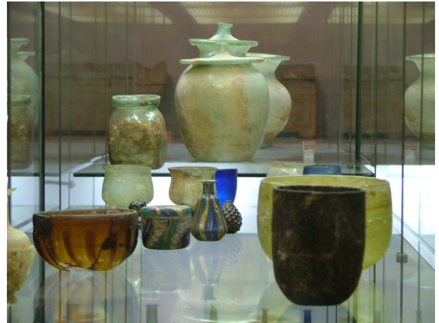
Anciens contenants pour médicaments. Musée Archéologique et Historique, Volterra, Italy.

Her CV is at the end of this issue in English. If you have any comment or concern, please send it to the Executive Committee. If not, this candidate will be considered as approved and will be received as a new member of our Academy at the next congress in Washington, next September / Leur CV est à la fin de ce numéro en Anglais. Si vous avez des remarques, merci de nous les communiquer. Sinon, ces candidat seront considérés comme élus et seront reçus comme nouveaux membre de notre Académie au prochain congrès de Washington, en septembre prochain.