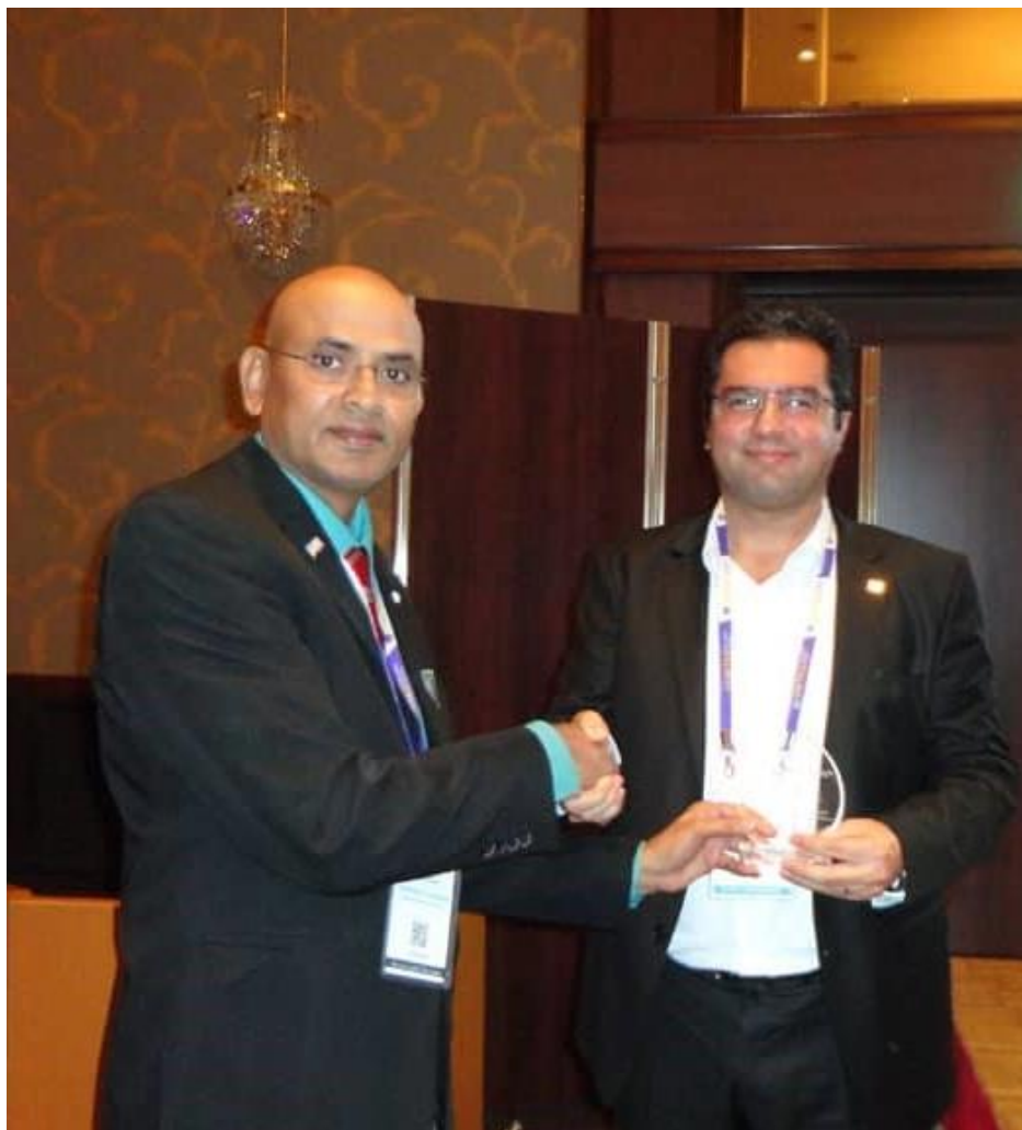
Participation as Chair of the Session of “Theories and Fundamentals of Traditional Medicine” and present oral presentation with the title of: “Management of stroke as described by Ibn Sina (Avicenna) in the Canon of Medicine”