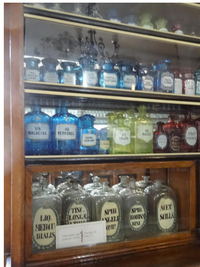
Old pharmaceutical bottles. Pharmacy-Museum, Lviv, Ukraine.