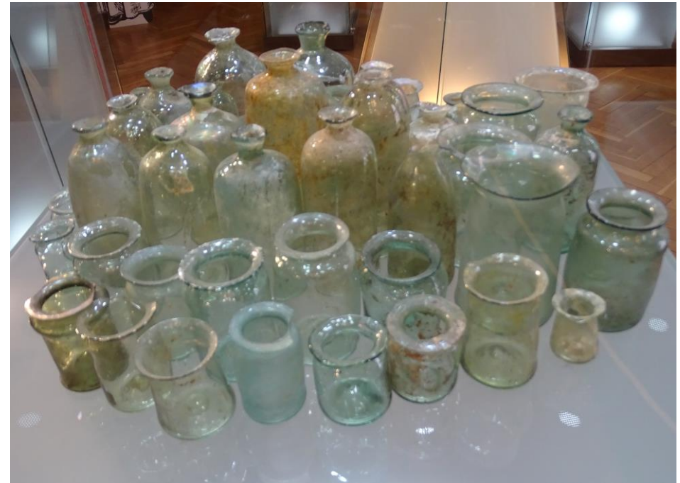
Glass vessels for medicines, the 19th century. Archeological-Historical Museum in Stargard, Poland.