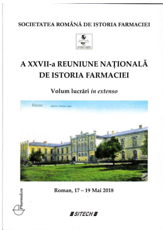
SRHP, La couverture n°1 du volume d'œuvres in extenso, 27e Réunion Nationale de l'Histoire de la Pharmacie, Roman (District de NEAMȚ), 17-19 mai 2018. (L'image de l'Hôpital „Precista Mare" (Grande Vierge Maria), fondé à Roman en 1872).